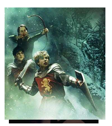
The Chronicles of Narnia promotes healthy family values such as decency, loyalty, courage and sacrifice.

showers it with prestigious movie-making awards. Such commendation of deviant behavior and the attack of the traditional family illustrate the tragedy of the pop culture today. When an Asian director joins the destructive force in breaking the moral code of what most Asian parents believe in, it is a tragedy for Asian Americans.