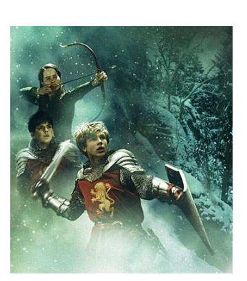
「魔幻王國」The Chronicles of Narnia 教導年青人正義、勇敢、忠心和犧牲精神。

樂界要極力介紹同性戀的電影,是要打破傳統的禮教, 讓放縱情慾的人,可在無罪 惡感的情況下自由自在地繼 續放縱,而社會需要無條件 地接受。利用潮流文化來推 廣破壞家庭的電影,是現代 文化的悲劇;李安導演拍這 種片子,等於加入破壞的行 列,是華人的悲劇和恥辱。